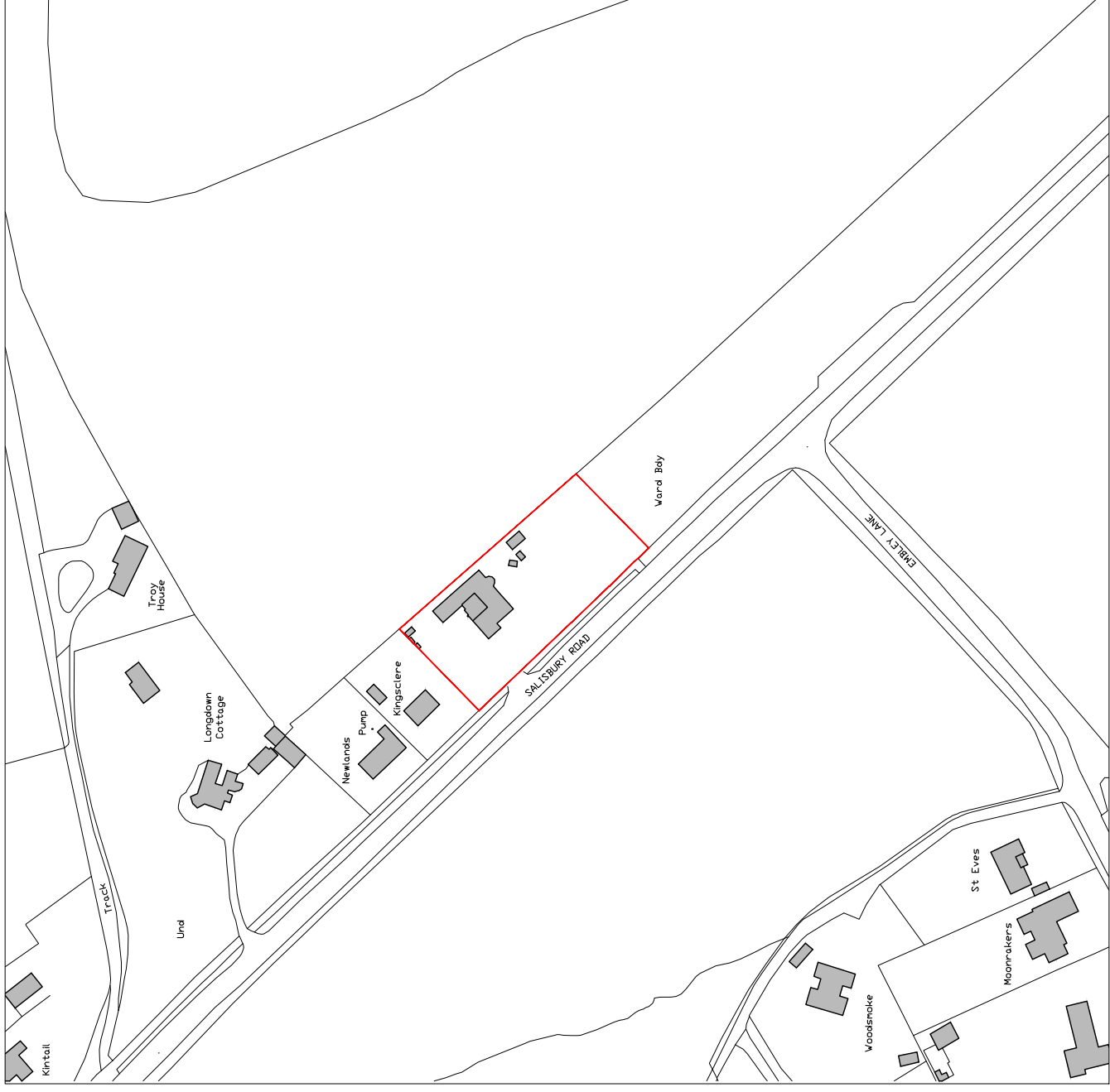
01 | LOCATION PLAN 1:2000